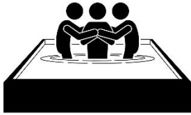
Easter Sunday baptisms