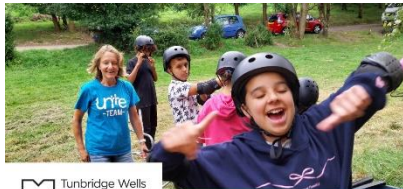
Tunbridge Wells YOUTH FOR CHRIST